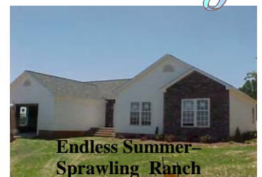
Endless Summer— Sprawling Ranch

1 level, Spacious, open, 3 bdrm, 2 bath. Laminate wood floors. Fireplace. Attached garage. $239,000.