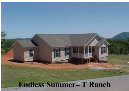
Endless Summer— T Ranch

ENDLESS SUMMER is the name of a residential subdivision on Route 626 just past the Smith Mountain Lake State Park in Huddleston. The setting and the views from this land are unforgettable. Smith Mountain in all it's glory is fully visible as well as the Craddock Creek section of the lake in one direction and the Roanoke/Blackwater channels of the lake in another direction, all this scenic vista surrounded by beautiful rolling farmland and mature forests. In days gone by before the lake filled, this section of ground was commonly known as "Mars Hill", in fact you can find it referred to as such on some maps today. I often wonder if it was named that because of the wonderful views. I bet that on a clear night, you can almost reach up and touch the stars.