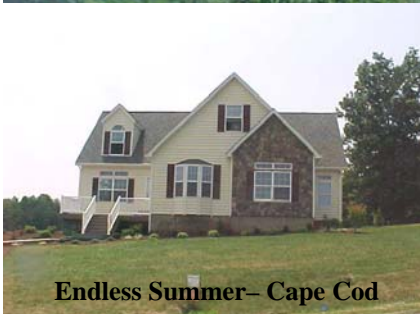
Endless Summer— Cape Cod

Great opportunity to get in on early pre-sale pricing.